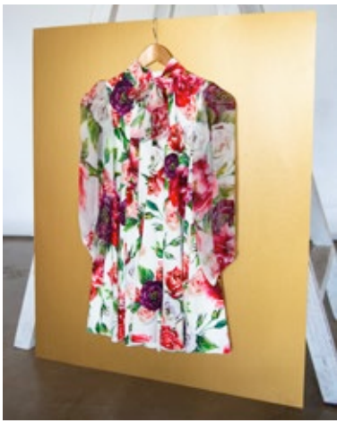
Floral Dress Dhs3,000 Dolce & Gabbana Kids at Harvey Nichols - Dubai