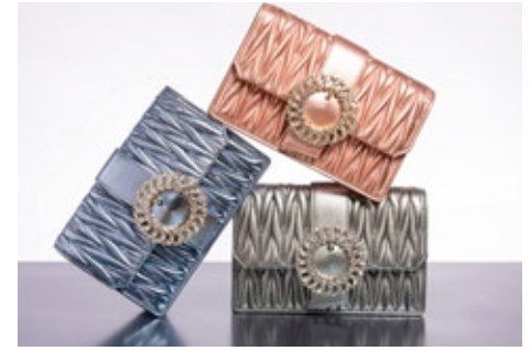
Bandoliera Matelasse Bags in Blue, Pink and Silver Dhs4,700 each Miu Miu