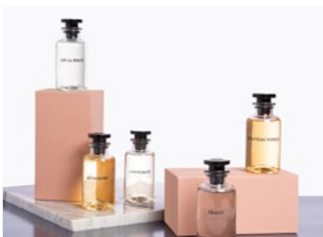
Les Parfums Men's Fragrance Collection in Sur la Route, Au Hazard, L'Immensité, Orage and Nouveau Monde Dhs1,100 for 100ml Louis Vuitton