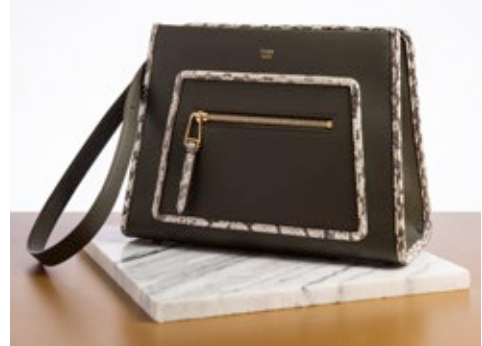
Exclusive Runway Bag in Green Grass Dhs9,100 Fendi