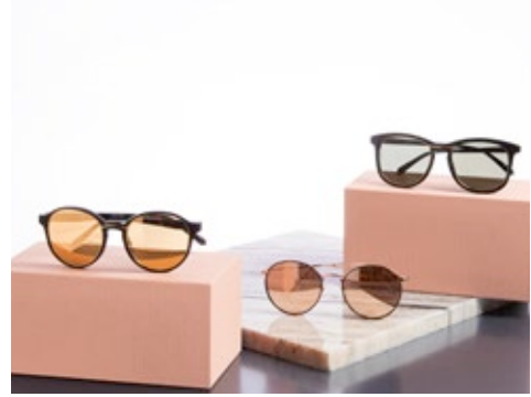
From left to right: Round Frame Acetate Sunglasses Dhs1,660 Round Frame Gold Tone Sunglasses Dhs2,783 Square Frame Acetate Sunglasses Dhs3,708 Linda Farrow Luxe at Boutique 1