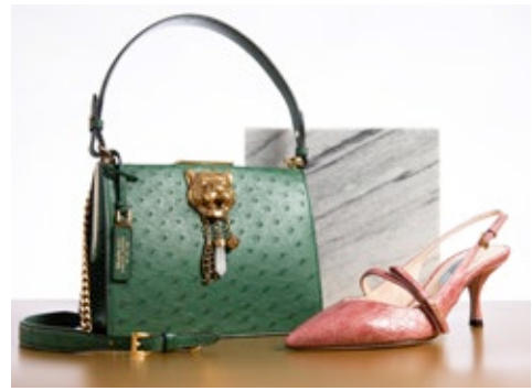
Special Edition Lightframe Bag Dhs30,700 Slingback Pump Dhs9,060 Prada