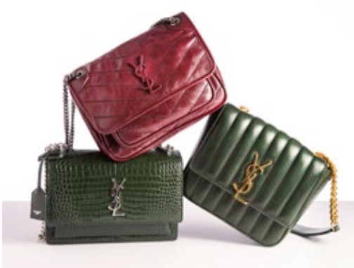
Clockwise from bottom left: Exclusive Middle East Sunset Bag Dhs8,900 Baby Niki Chain Bag Dhs7,900 Vicky Bag Dhs9,900 Saint Laurent