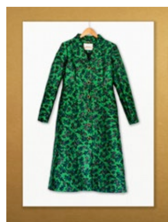
Dominique Tailored Coat Dhs8,000 Erdem at Harvey Nichols - Dubai