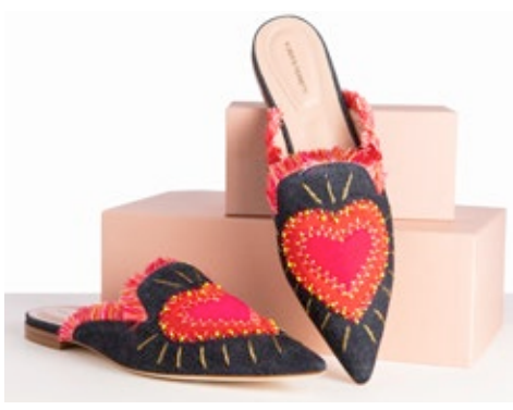
Mia Embroidered Denim Slippers Dhs2,995 Alberta Ferretti Exclusive to Boutique 1